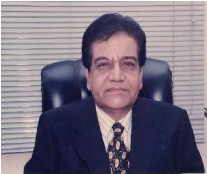
tch mipei Kty tZvqe Lvb