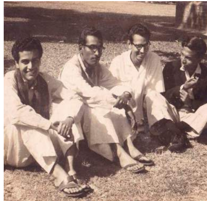
1960 mřtj tčh Křřei j řb řLvkřř | tZvqve Lvb, řřgi řj L`řZ BřĎřřKi mseřř K I Křřwg ÷ Avřřg` ř řngřb (1965 mřtj Křřřřřq řcAvřBG řegřb` řřřbřq řbřZ), L`řZbřgv mseřř K ř GKřřřj i Z`gřřř cřřřZ Avřbřřři Rřřř` ř L`řZbřgv mseřř K cřřřZ mřř gřřřř (emř Ae`řq evg ř_řK řřřřřřř)