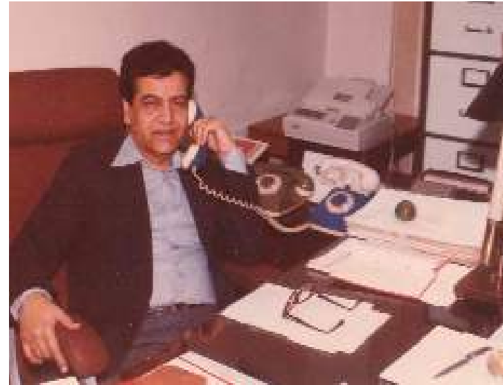
tch mipe intme KgPZ