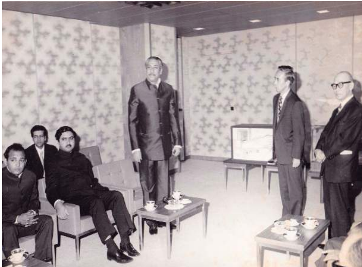
Rıvırb ivótg mdi Kıtj ežeÜz mıt½ | W. Kıvgj tıvımb I tZvdıtaj Avıgt` i gıSLırb tZıvqe Lib |